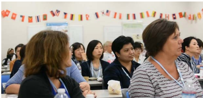
Students' and Researchers' Presentation session