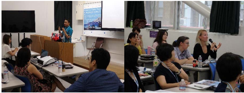
Students' and Researchers' Presentation session