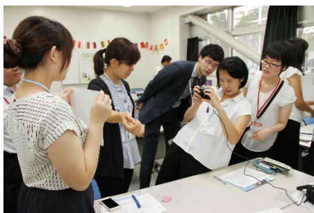
Hands-on seminar: Infrared thermography