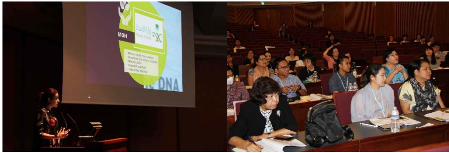
Healthcare system and Nursing session