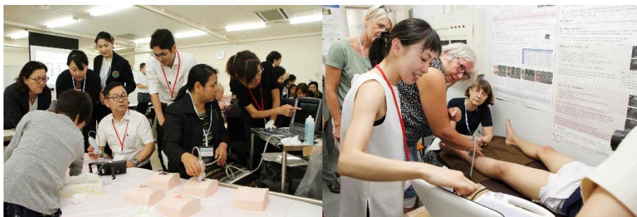
Left : Hands-On Seminar: Ultrasound: Deep tissue injury