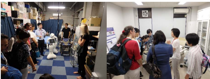
Left : Engineering Laboratory

From 18:00, some participants went on a tour to visit Global Nursing Research Center laboratories. They observed the facilities in the center and discussed the research results.