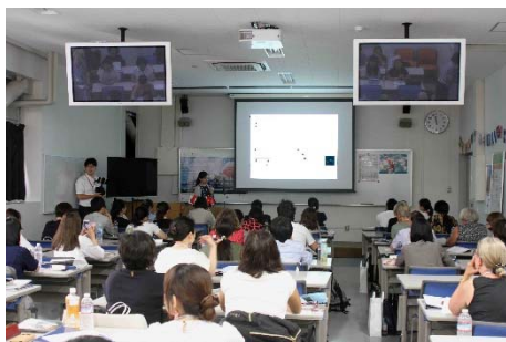
Students' and Researchers' Presentation session