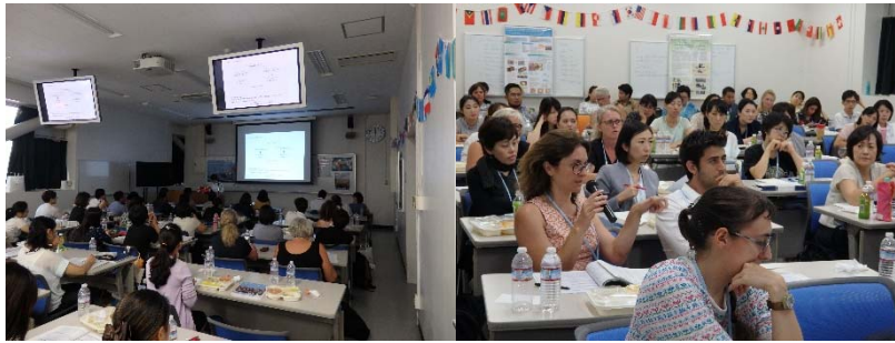
Students' and Researchers' Presentation session