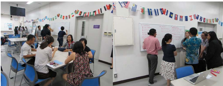
Student Networking session

From 18:00, Student Networking session was conducted in Faculty of Medicine Bldg. 3. In group-based workshops, active discussion was conducted.