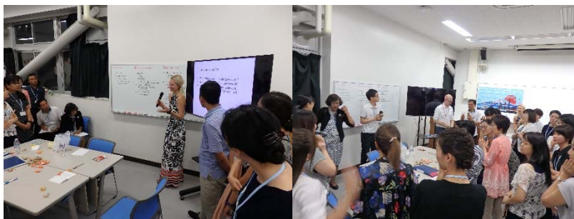
Presentation in Student Networking session