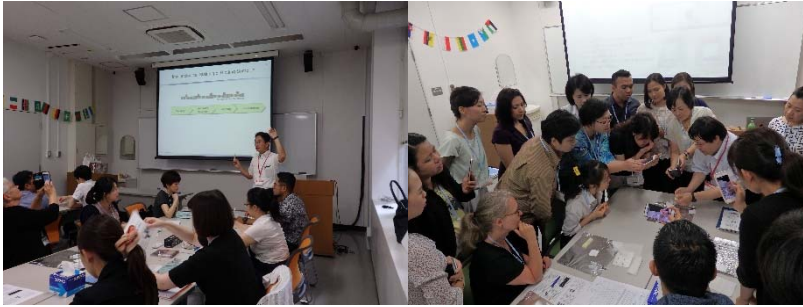
Hands-on Seminar on Skin Blotting