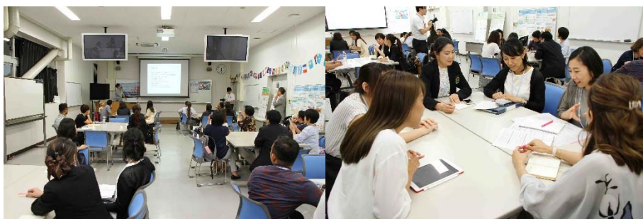
Student Networking session

self-introduction, the participants were actively engaged in discussions.