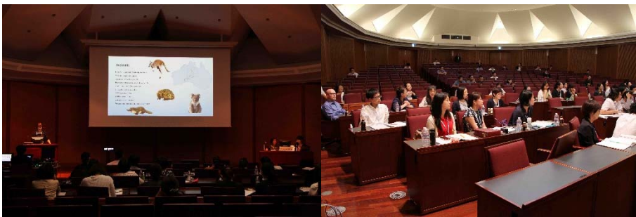
Healthcare system and Nursing session