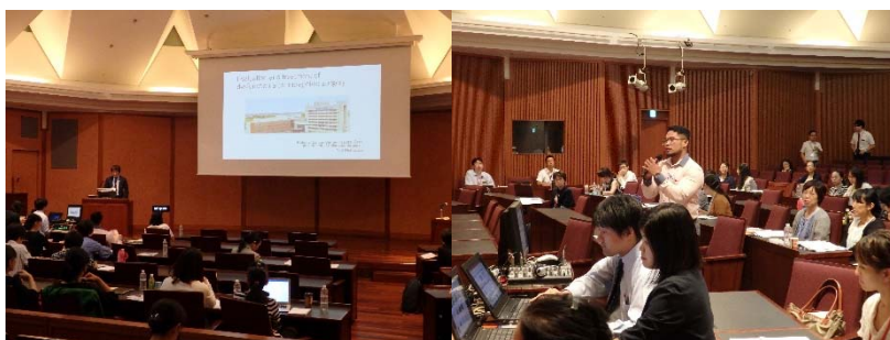
Case Study session