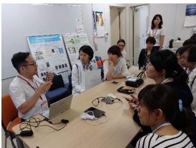
Participants visiting Imaging Nursing Laboratory on GNRC tour

Some participants went on a Global Nursing Research Center tour. They observed the facilities and discussed research results.